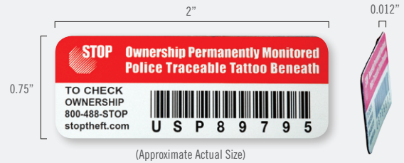
(Approximate Actual Size)