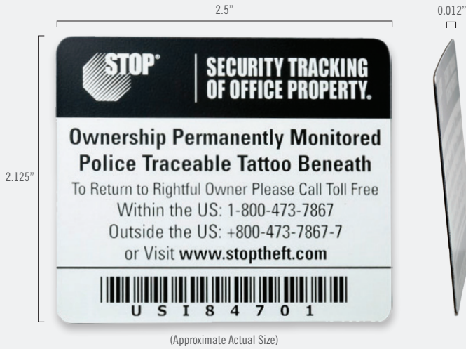
(Approximate Actual Size)